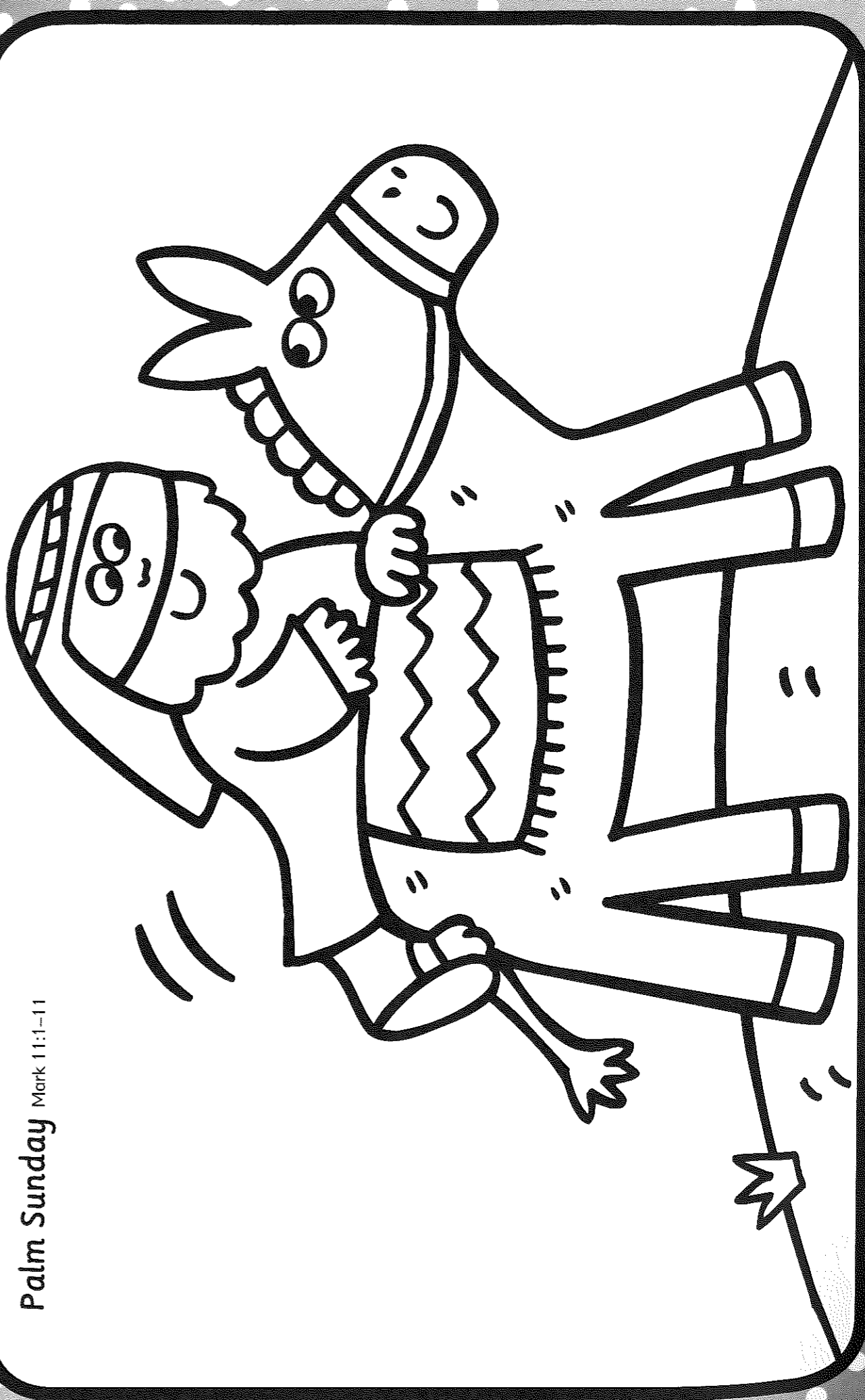
Palm Sunday Mark 11:1-11

4 Look at the pictures again and ask the children to cheer and wave, as the people in the crowd did. Explain that we can feel just as excited today because Jesus is our friend: cheer and wave again!